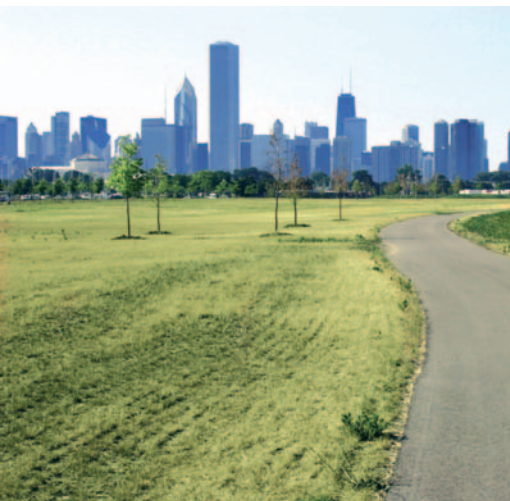
Using less energy means a reduction in CO 2 emissions. DuPont™ Energain® is a smart solution aligned with the need to construct sustainable buildings for an environmentally friendly future.