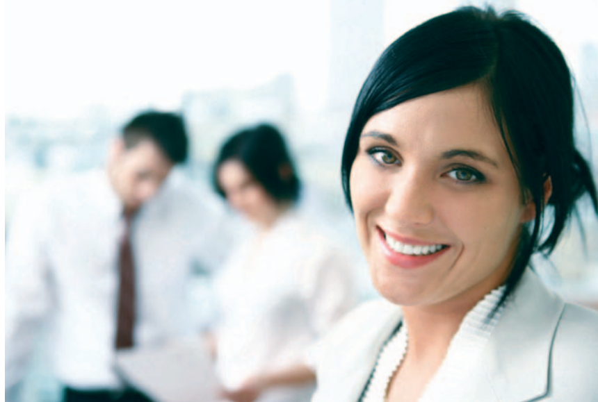
DuPont™ Energain® controls temperature fluctuations, keeping the inhabitants of a room comfortable without having to frequently flip between air conditioning and heating systems.

Heat from solar gains and temperature fluctuations can cause degrees of discomfort to the inhabitants of low inertia buildings, where thermal mass is limited. Put simply, buildings get too hot when solar gains and external temperatures are high and too cold when temperatures are low. DuPont™ Energain® regulates temperature fluctuations at both ends of the scale, ensuring that comfort levels are readily maintained, without having to resort to excessive use of cooling and heating systems.